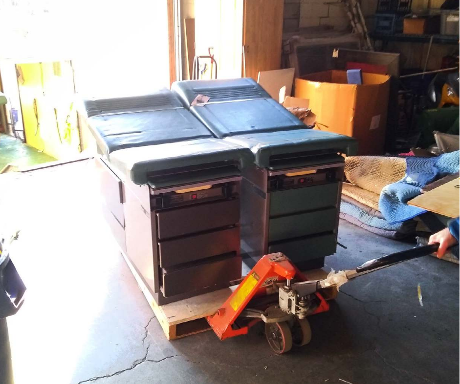
Donated exam tables are ready to ship out of the Maine warehouse.