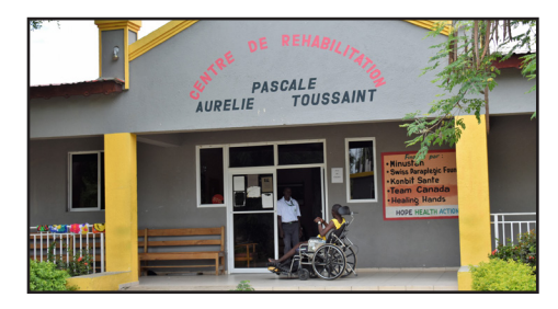
A 60-bed private hospital that also operates the primary spinal cord rehabilitation center for northern Haiti